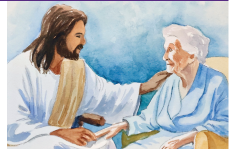
Feeling anxious or alone? Several articles dig into God’s Word to give you ideas of how to cope (pp. 16–19).