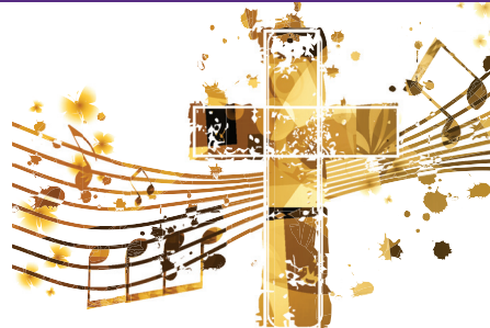
Discover the extraordinary Ordinary, five liturgical songs that offer consistency and flexibility for proclaiming the gospel (p. 12).