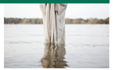
Was John's baptism the same as the baptism commanded by Jesus? Don't miss this month's "Please explain" (p. 30).